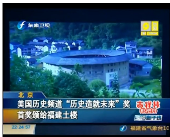
Figure 12. The First History Made for Tomorrow Grant awarded to Fujian Tulou of China by A&E Television Networks (AETN).

So we see a lifestyle and a building that have been maintained and sustained through history into present days, ensuring a history that is made for tomorrow.