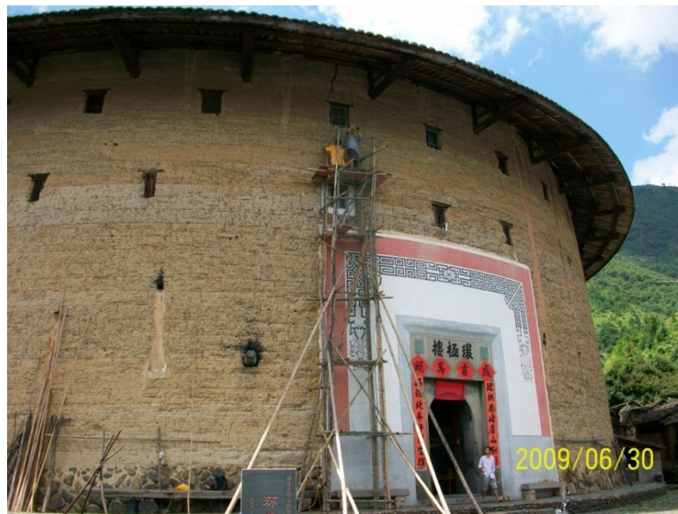
Figure 9. The researchers are investigating the crack of Huanji Tulou.

The earthen walls also work as thermal regulators. When temperatures rise in summer, heat is drawn into the walls helping to cool the air... then as temperatures drop in the winter, heat is released for natural warming.