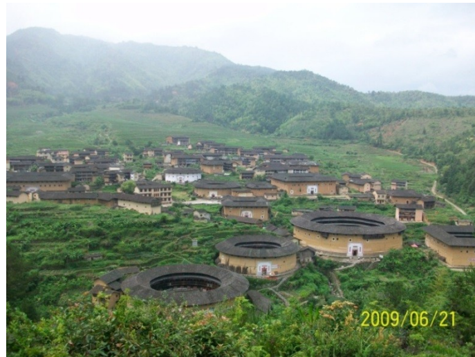
Figure 11. Hakka people living in harmony with nature, Chuxi Village, Yongding County.

The future is quite promising if we build on what we learned from Hakka through the collection of data. That knowledge will be utilized to develop global models for modern green buildings. This is the work that will pave the way for future technologies promoting sustainable preservation initiatives for the Hakka people and the rest of the World.