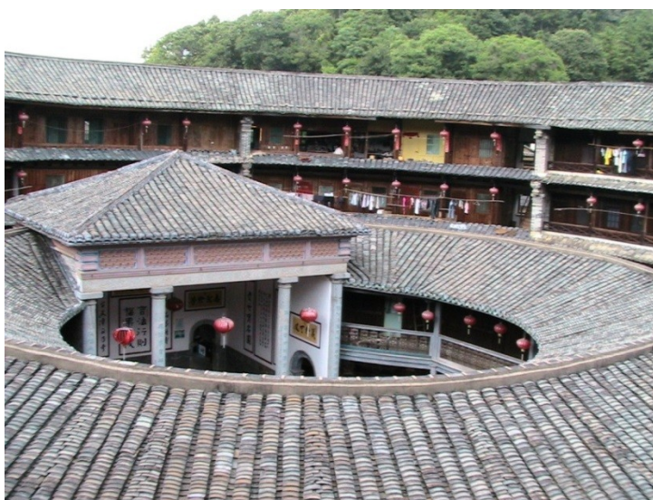
Figure 5. The 2009 anniversary celebration of inscription of Hakka Tulous into World Heritage sites.