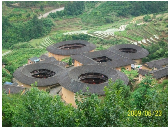
Figure 3. Inner wood floor structures and multiple-ring buildings inside Chengqilou, Gaotou Village, Yongding County of Fujian Province.