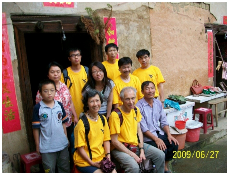
Figure 7. Group photo of the international team members researching on Tulous with the Owner of Fuxinglou.

Rammed earth walls not only stand the test of time, they leave virtually no carbon footprint.