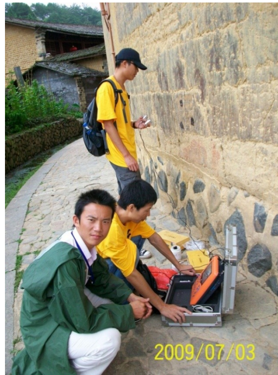
Figure 8. Ultrasonic devices being used to measure the strength of a rammed earth wall.

Another vital component of sustainability is the Tulou's ability to withstand earthquakes. Hakka Tulous have survived material aging, natural weathering and strong earthquakes for hundreds of years. "The thick rammed earth walls integrated with internal wooden structures could be a critical factor contributing to their superior earthquake resistance", Liang explained. "Finite element analyses are conducted to better understand the structural response of a Hakka earth building under earthquake-induced load". But not even Liang's most cutting edge technology could explain how a rammed earth wall might even be able to repair itself after a great quake. It is reported that there was a strong earthquake in 1918. That earthquake created a huge crack in the earth wall of Huanji Tulou, located in Nanxi Village, Hukeng Town. The crack was about three meters long, 20 centimeters wide. But reportedly, that crack just amazingly self-healed, to the present five centimeters wide. Figure 9 shows the researchers from West Virginia University and Xiamen University are investigating the crack of Huanji Tulou. The rammed earth wall of Huanji Tulou was found unreinforced. "If the earth wall were reinforced with bamboo or fir branches, the cracking would not be induced", said Dr. Liang [8].